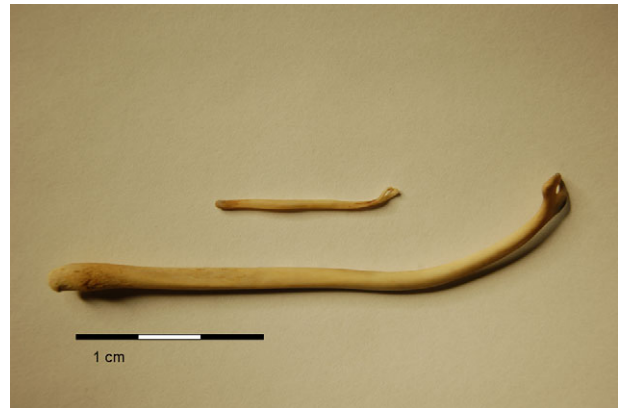
Figure 1. Typical bacula of the adult marten ( Martes americana , above) and fisher ( Martes pennanti , below).

Sample sizes varied among statistical tests because not every individual had every dimension measured. Males were significantly larger than females for both M. pennanti and M. americana for body length ( M. americana , male mean = 40.30 cm, female mean = 35.60 cm, t_{1045} = 40.23 , P < 0.001 ; M. pennanti , male mean = 62.42 cm, female = 51.44 cm, t_{781} = 57.27 , P < 0.001 ), chest girth ( M. americana , male mean = 11.79 cm, female mean = 9.60 cm, t_{453} = 25.4 , P < 0.001 ; M. pennanti , male mean = 24.90 cm, female mean = 17.79 cm, t_{362} = 30.47 , P < 0.001 ), and zygomatic width ( M. americana , male mean = 4.50 cm, female mean = 3.87 cm, t_{122} = 10.05 , P < 0.001 ; M. pennanti , male mean = 7.86, female mean = 5.81, t_{195} = 40.0 , P < 0.001 ). Sexual size dimorphism was